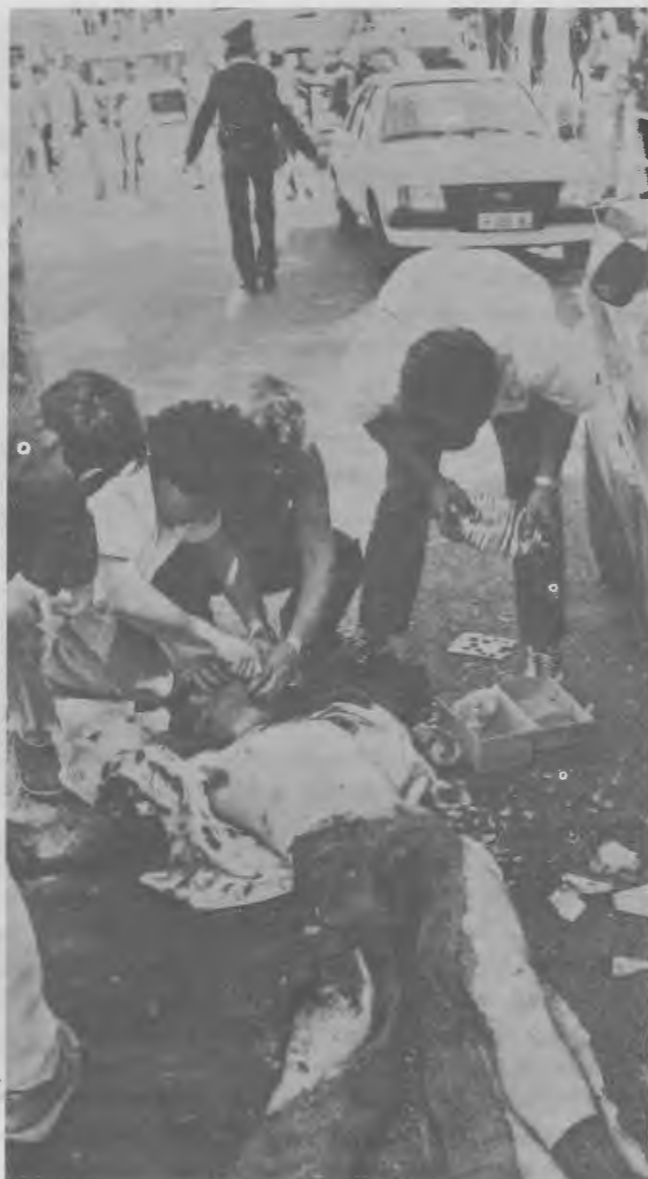
DFLP's heroes of the Jerusalem operation

A spokesperson from the military censorship stated soon after the operation that he would not allow any details of the operation to be published. The Zionist repressive forces warned the press against publishing news regarding the operation. A correspondent from the United Press told that those ►