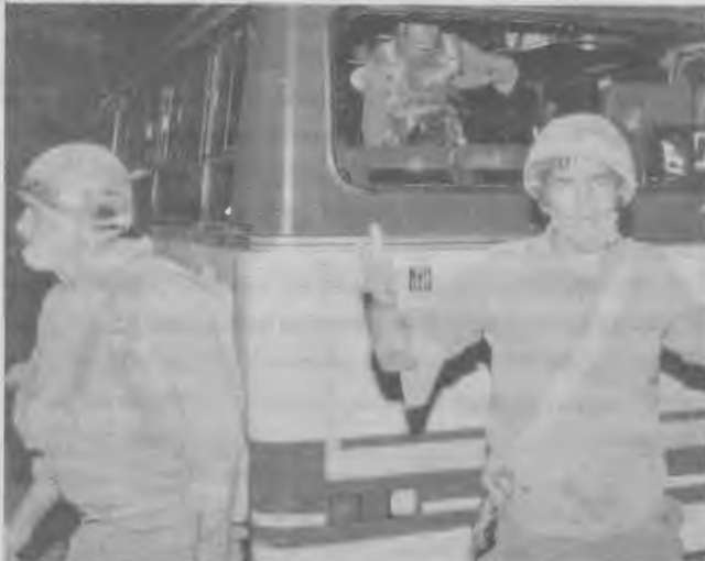
Israeli repressive forces in panic