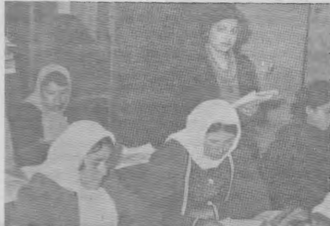
Women campaign against illiteracy