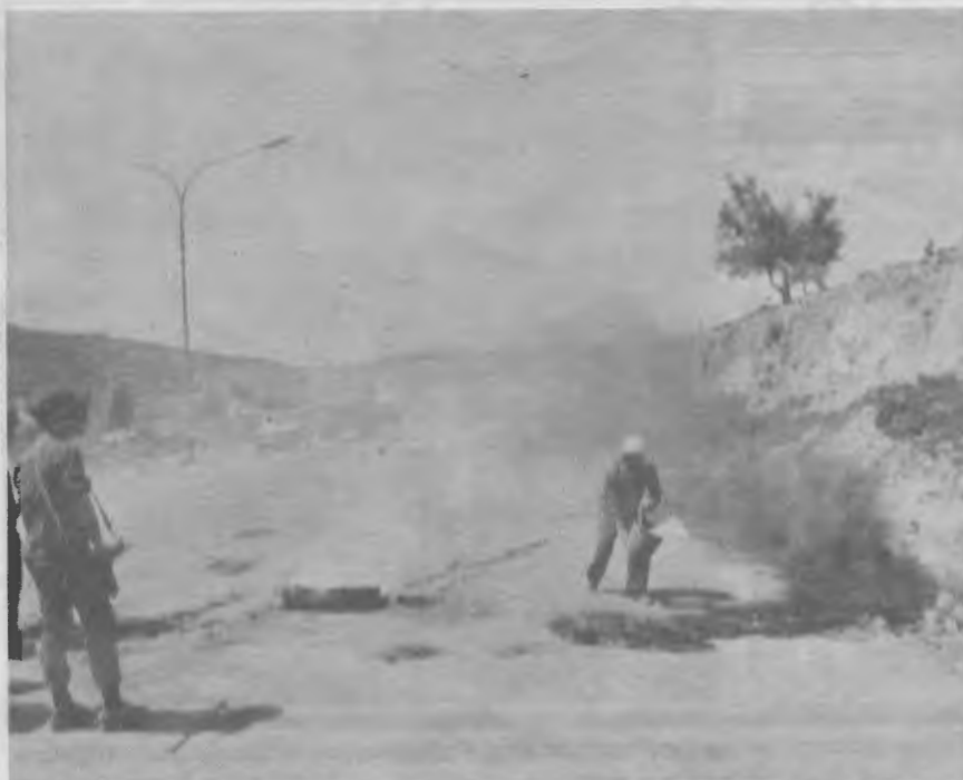
Putting off fires of angry Palestinian masses