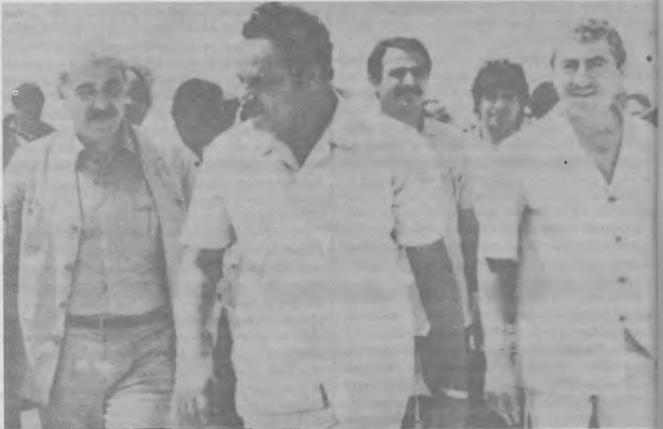
Comrades Ali Naser Mohammed, George Habash and Nayef Hawatmeh

There was prior agreement between the four organizations regarding our position towards Arafat. This was expressed in the joint communique issued right after the visit. As I mentioned, more important than the political declaration is the results reached that will unite and determine our tactics in the coming stage; the essence of this will be seen in the near future.