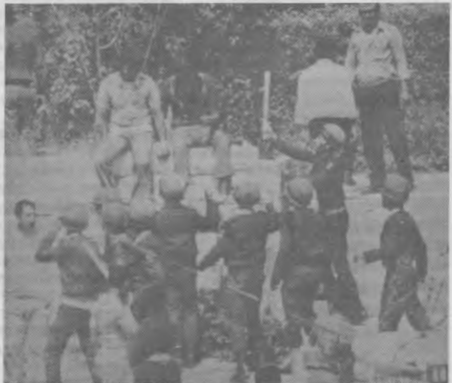
The people of Galilee demonstrate against repressive policies

In the town of Sakhnin, in the central Galilee, various demonstrations were held where Palestinian flags were raised. The enemy radio broadcast stated that the demonstrators closed all the main roads leading to the villages and towns of Galilee.