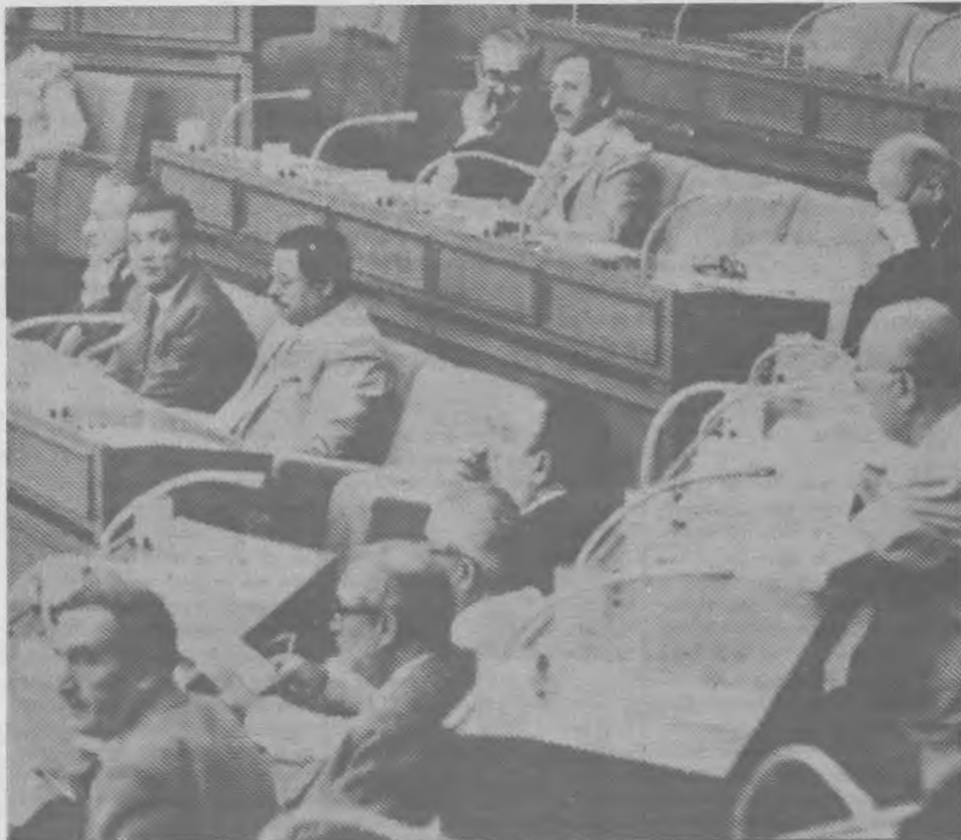
Jordanian Parliament in session

We have no illusions that the nationalist and democratic forces can make gains in the context of the pseudo-democracy offered by the Hashemite